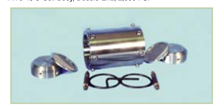
#170-45 Cell Assembly for Cement Testing, 175 mL

#170-45-3 Cell Body, Double-End, 2,000 PSI