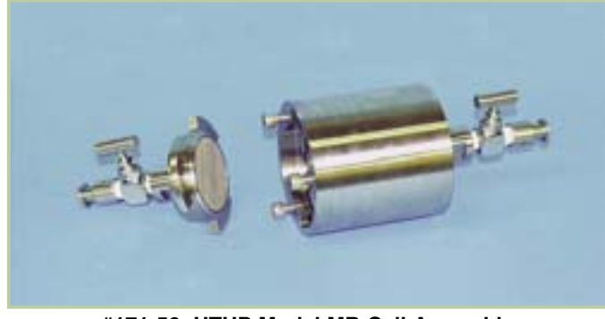
#171-56 HTHP Model MB Cell Assembly

#171-80 Needle Valve with Modified Handle, Male, 1/4"