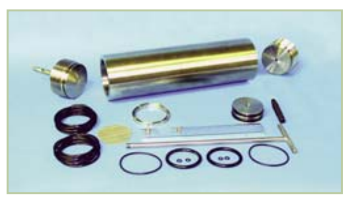
#171-85 PPT Cell Assembly, 4,000 PSI